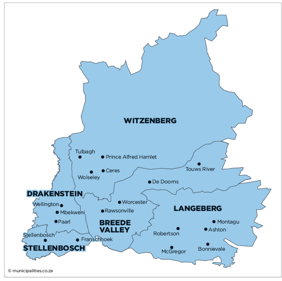
MAP 1.1: The local municipalities located within the district, as well as the hierarchy of the main towns within each local municipality.